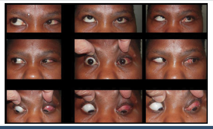
Figure 3: Versions observed one month post operatively. Elevation deficit improved but still present. Left abduction deficit improved.

spared in this case. The most common causes for traumatic rectus muscle rupture are due penetrating trauma with a metal hook or iatrogenic during endoscopic sinus surgery [7]. The inferior and medial rectus muscles are by far the most commonly traumatized muscles [5,7]. This may due to the Bell's phenomenon that would occur peri trauma, directing the eye upwards and outward, thereby exposing the inferior and medial rectus muscles. It may also be related to these muscles inserting closest to the corneoscleral limbus [2]. The medial rectus is also one of the more commonly operated on rectus muscles in strabismus surgery, putting it at higher risk of being lost [6].